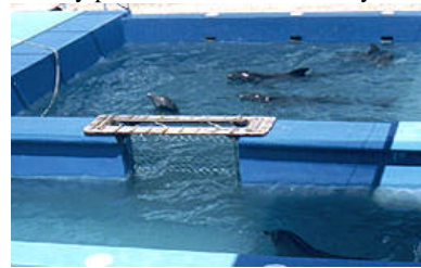
BUT The Bitter Truth: CAPTIVITY & SLAVERY